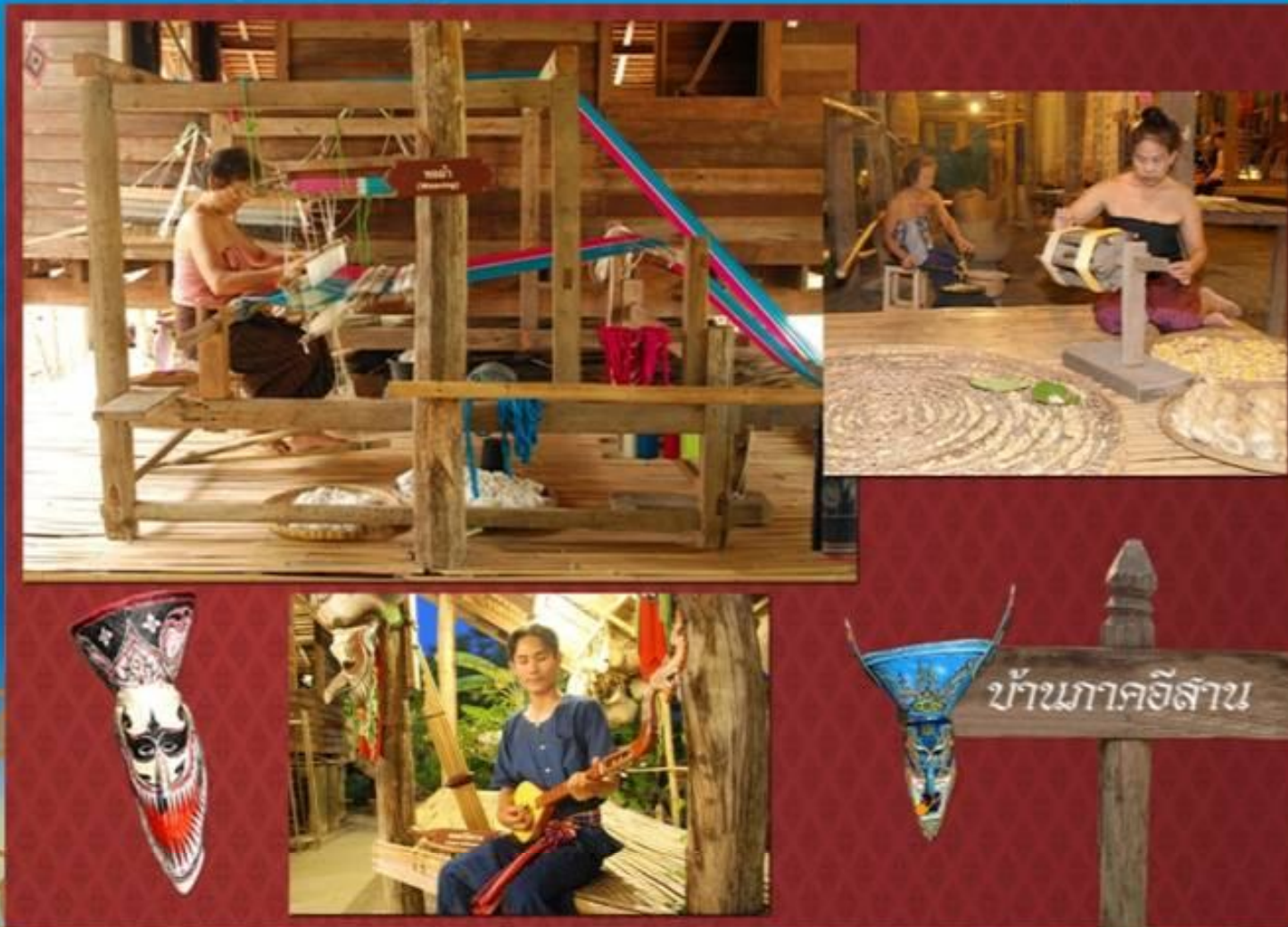
Traditional Thai house, Northeastern Region